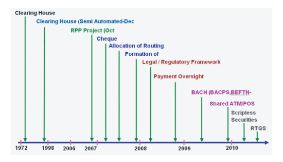
Remittances and Payments Challenge Fund (RPCF)

10.27 The initiatives will be implemented according to the Payment and Settlement Systems Strategy phase by phase. Following is the timeline along with the major steps taken for developing payment systems in Bangladesh.