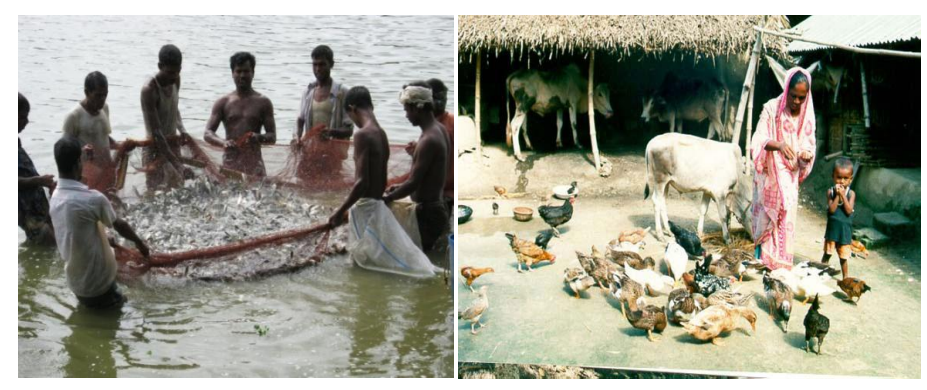
April , 2015