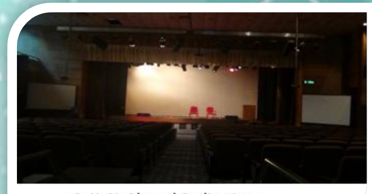
A. K. N. Ahmed Auditorium

There is a large auditorium in the academy named A. K. N. Ahmed Auditorium. In the auditorium, there are facilities of organizing seminars, conferences, cultural activities and many more.Presently, the auditorium has a capacity of 450 seats.It is well- equipped with modern facilities, such as central Air Conditioned System, State-of-the Art Lighting, Audio-visual System etc.