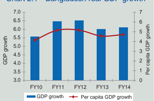
Chart 2.1 Bangladesh real GDP growth

Source: Bangladesh Bureau of Statistics. P= Provisional